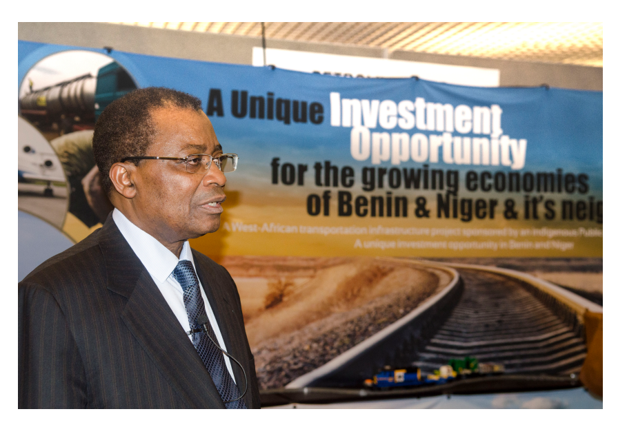
PAGE 3 / Pic Network Ltd. | Backbone Project - Epine Dorsale | www.epinedorsale.com

This 1,032 km rail line consists of the existing COTONOU - PARAKOU (438 km) line along with its PARAKOU-DOSSO-NIAMEY (594 km) extension. This rail line will be rehabilitated and built with the standard track gauge (1,435 m).